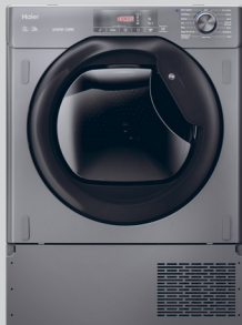
SKU: 31900550 Description: HDB4 H7A2TBERX80 Brand: Haier