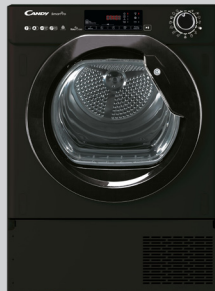
SKU: 31900537 Description: BCTDH7A1TCEB-80 Brand: Candy