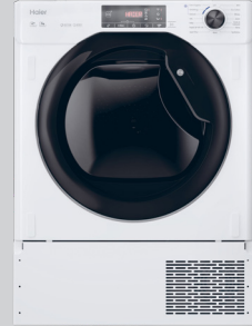
SKU: 31900541 Description: HDBI H7A2TBEX-80 Brand: Haier