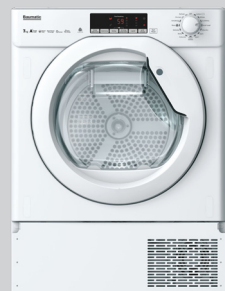
SKU: 31900533 Description: BBT D H7A1TE-80 Brand: Baumatic