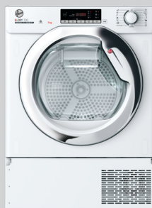
31900536 BATD H7A1TCE-80 Hoover