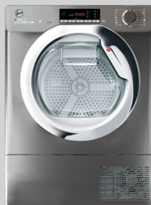
SKU: 31900542 Description: BATD H7A1TCER-80 Brand: Hoover