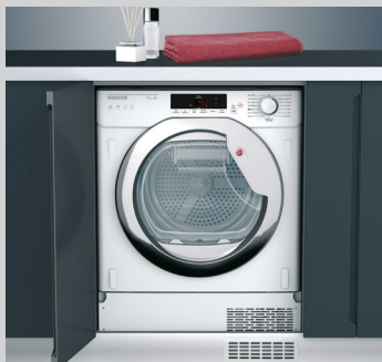
SKU: 31900010 Description: HTDBW H7A1TCE-80 Brand: Hoover