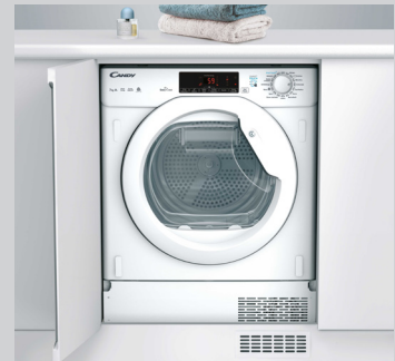
SKU: 31900011 Description: CBTD H7A1TE-80 Brand: Candy